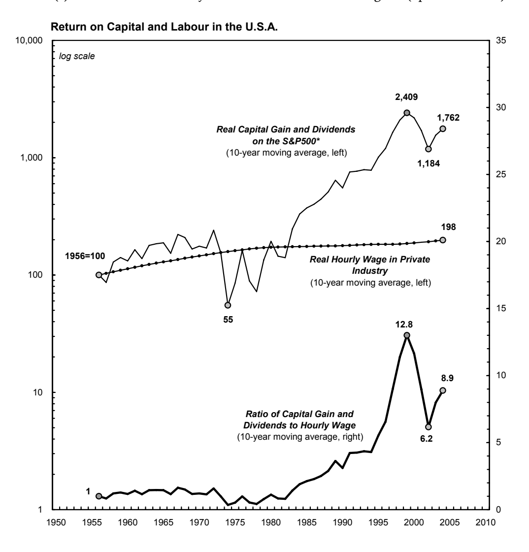
NOTE: real series are computed by deflating nominal data by the CPI. * Capital gains and dividends is the difference between successive values of the S&P500 Total Return Index. SOURCE: U.S. Bureau of the Census through Global Insight; Global Financial Data (www.globalfindata.com)

1. (25%) The top part of the figure below compares two U.S. time series. One series is the 'real' hourly wage rate in private industry. The other series, also expressed in 'real' terms, is the sum of capital gains and dividends earned from investing in the S&P500 index. The bottom part of the figure computes a 'differential' index: the ratio between the nominal wage and the nominal capital gains and dividends. (a) Explain the difference between nominal and 'real' measures of income. (b) Explain the meaning of a 'differential' index and how it differs from 'real' measures of income. (c) What conclusions can you draw from the data in the figure? (up to 500 words).