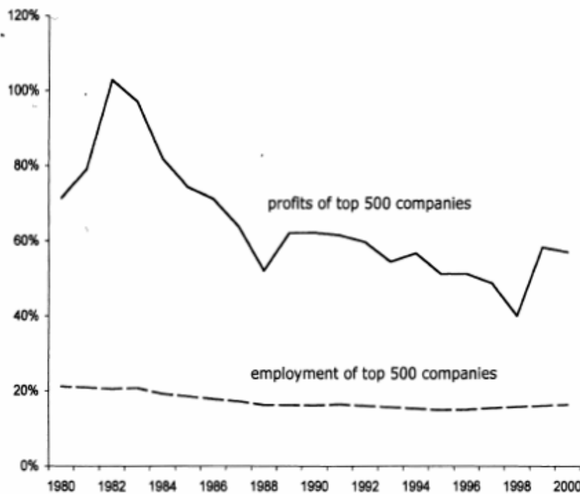
FIGURE 11.4 Declining concentration in the U.S. economy, 1980–2000. This figure shows that the relative importance of the top 500 U.S. corporations, whether measured in profitability or in employment, declined between 1980 and 2000. The data on the profit share is taken from Forbes magazine's annual list of the 500 most profitable U.S. companies, with the total profits made by these companies (not necessarily the same firms every year) expressed as a fraction of the total amount of profits made by all corporations in the same years. The fractions for each year are shown in the figure as percentages. These percentages are substantial because the Forbes profit data come (by definition) only from companies that are making huge amounts of profit, whereas the data on the profits of all corporations take into account the losses incurred by some corporations. Thus, in the recession year 1982 the total profit made by Forbes 's 500 most profitable firms actually exceeded the total profit of all corporations, many of which did not do well in that year; this explains the 103 percent data point for the 500 most profitable firms' share of corporate profits in 1982. The data on the employment share of the largest corporations are also taken from the Forbes annual lists and are similarly calculated as a percent of the total employment of all U.S. corporations (see the dotted line in the figure). Over the two decades represented in this figure there was some movement up and down in both sets of data (especially the one pertaining to the profit share), but both the profit share and the employment share of the top 500 companies were lower in 2000 than they had been in 1980.

Source: Lawrence J. White, "Trends in Aggregate Concentration in the United States," Journal of Economic Perspectives , vol. 16, no. 4, fall 2002, pp. 137–160.