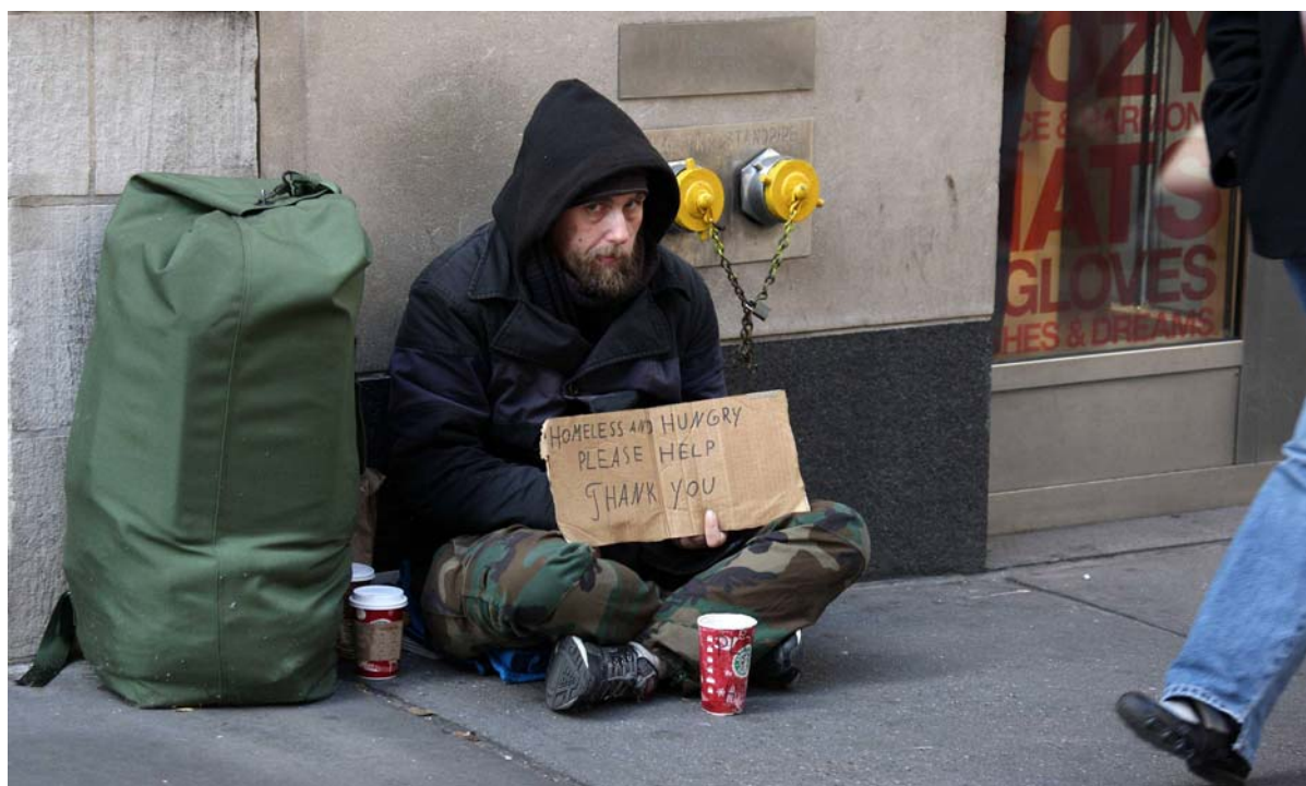
A HOMELESS MAN in Manhattan, New York, a file picture. Unemployment in the U.S. has been rising since the 2008 crisis.